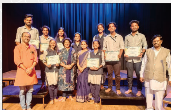
Theatre workshop at Rangayana