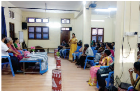
Yashodeepa-Parents Meeting Cell