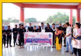
Certificate Course on Theatre Education