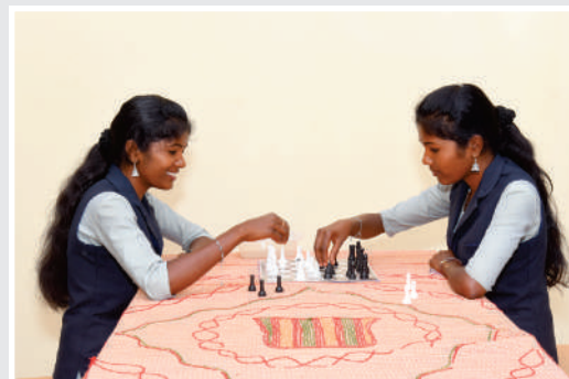
Indoor sports & games