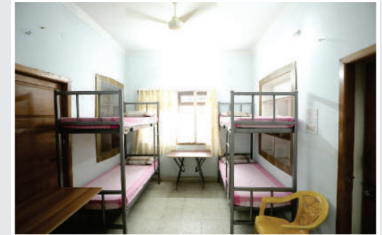
Four sharing room