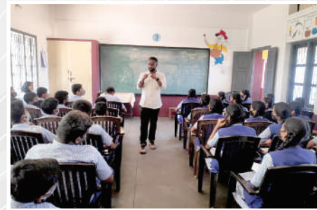
Rural Awareness programme on mobile addiction