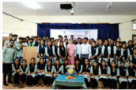
Youth Day celebrated by the NSS Unit