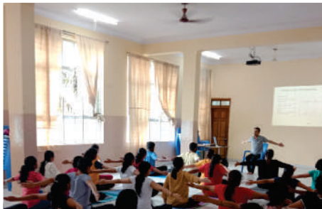
Yoga and Wellness