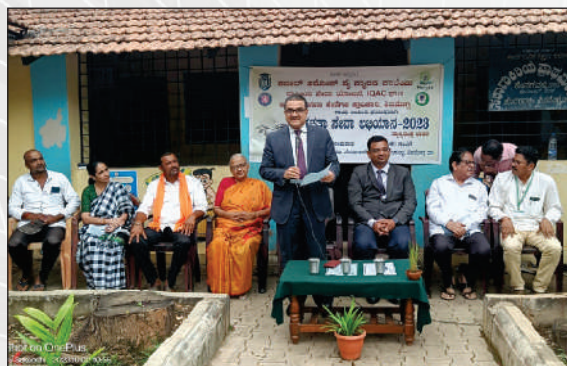
Community Outreach Programme at Sevalal Nagar