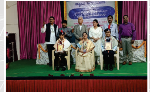
NSS State Award