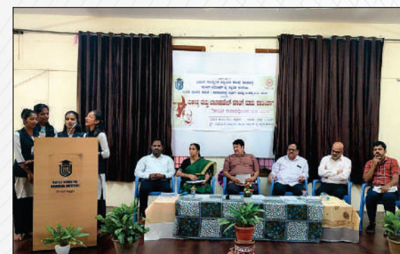
Workshop on Gandhi and BR Ambedkar