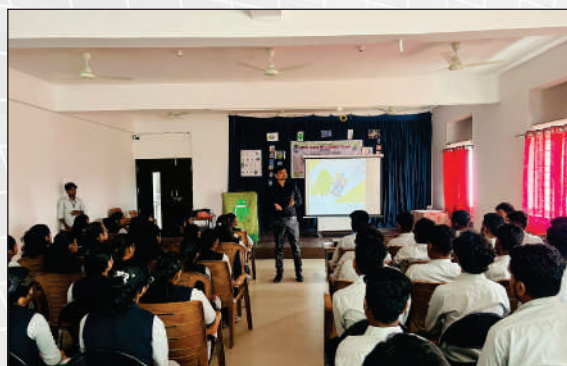
Inauguration of BCA club