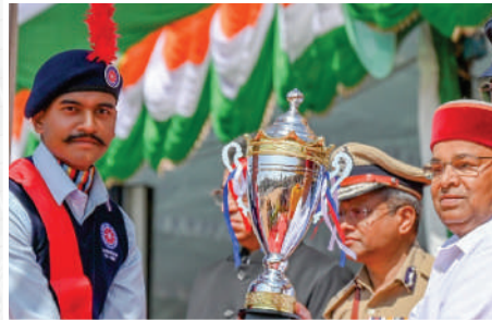
NSS Team secured 2nd prize in State Republic Day Parade-2024