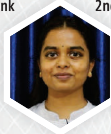
Jhansi G P