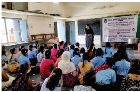
Menstrual hygiene programme for School students