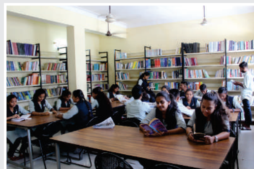
Library with access to books, journals & E-materials