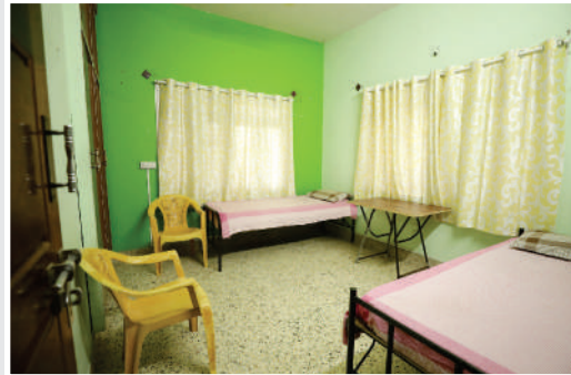
Two sharing room