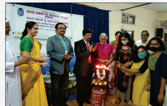
The VC and Registrar inaugurating PG Department