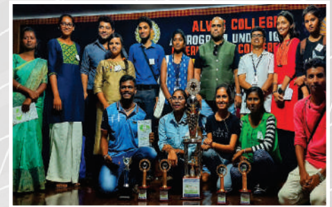
KAPMI students participated in Alva's Fest